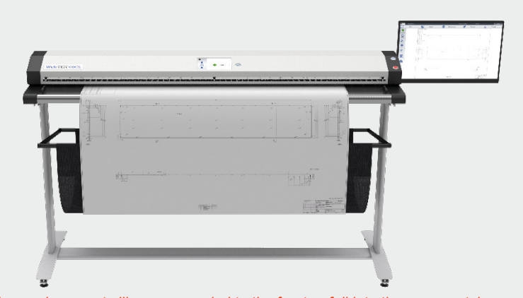
Large documents like maps rewind to the front or fall into the paper catch.

The WideTEK<sup>®</sup> 60CL produces extraordinarily sharp images, with color accuracy even superior to competing CCD scanners. Document rotation is done on the fly, a scan of an E-sized / A0 document in landscape at 300 dpi in 24bit color takes less than 7 seconds to scan and another 2 seconds to crop & deskew, preview and store.