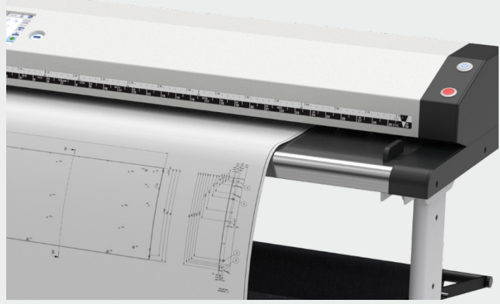
A USB 3.0 port lets you take away your scanned images on a USB device.