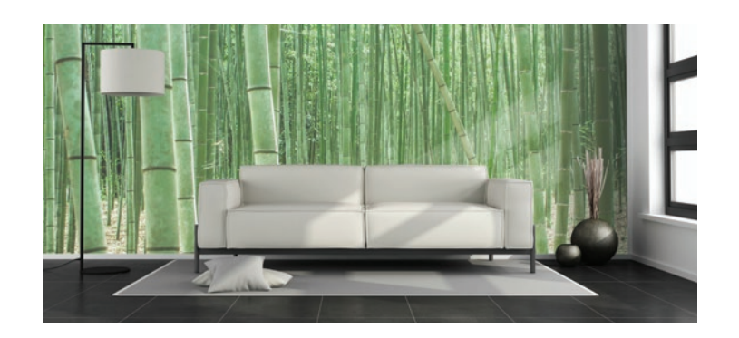
Photo wallpaper, on the other hand, looks best with a high-gloss finish that makes the colors pop. Give your customers realistic photo images that inspire.