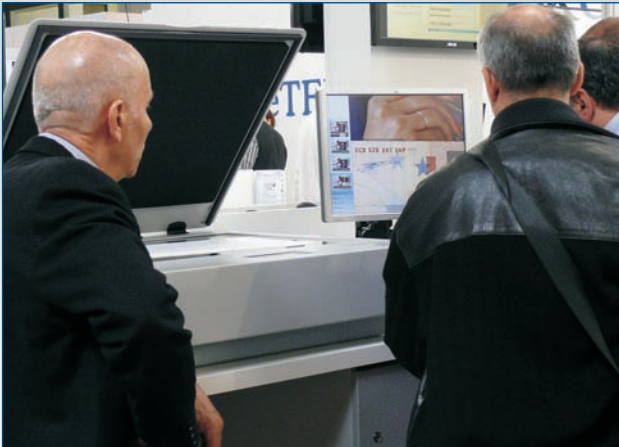
A standalone solution with touchscreen and monitor

Operation via touchscreen, monitor and Mobile Devices without a client PC