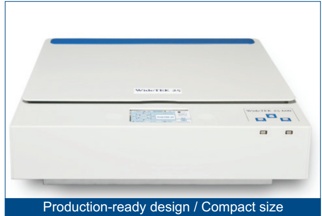
Production-ready design / Compact size

The WideTEK 25 can scan just about anything: from business cards to diagrams in A2 format, books, newspapers, maps, construction drawings, bound documents and more. The scanner needs less than three seconds to scan the largest format of 25 x 18.5 inches in a brilliant quality.