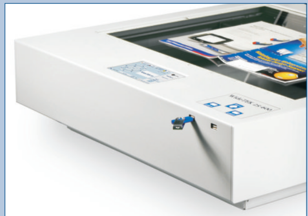
Walk-up Scanning to USB-Stick

Via our new application for mobile devices, Scan2Pad; you can also operate the scanner using your iPad, iPhone or Android tablet or smartphone and save the images to your mobile device.