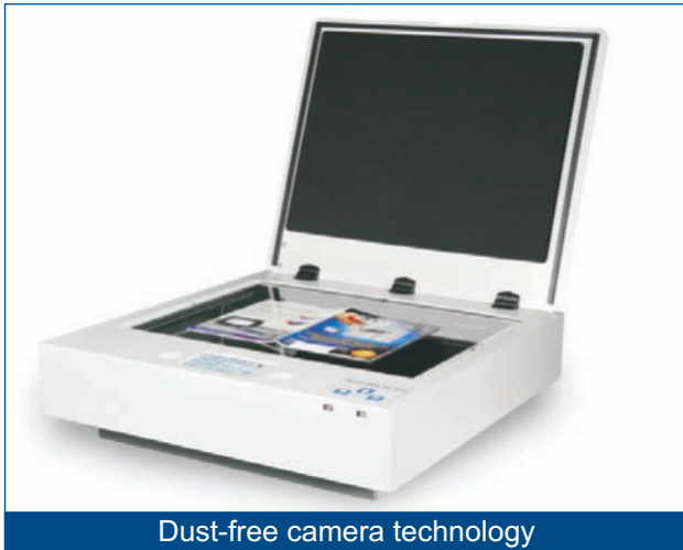
Dust-free camera technology

The cutting-edge camera technology, consisting of a dust-protected, hermetically sealed camera box holding CCD systems using a patented stitching procedure, delivering a maximum resolution of 1200 dpi.