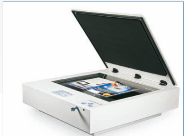
An efficient scan solution - der WideTEK 25-600

An external monitor connected to the scanner can be used for image control or to modify the scan parameters, without the need for a client PC.