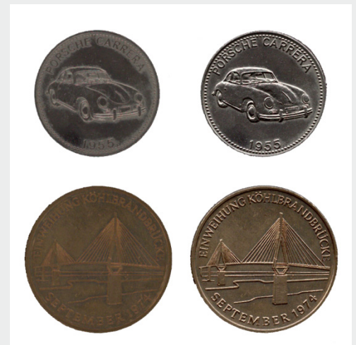
2D scan versus 3D scan, capture all details