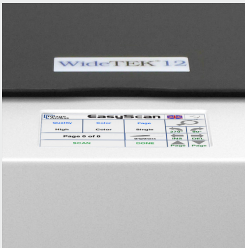
Large color touchscreen for simplified operation