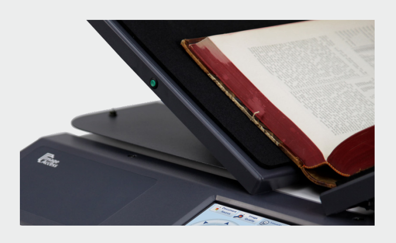
Book cradle in 120° V position.