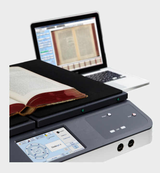
Bookeye® 4 Professional with scan client.

Image Access has four powerful software packages in its portfolio, which enable the Bookeye <sup>®</sup> 4 Professional optimal capture for large projects. Batch Scan Wizard, BCS-2<sup>®</sup>, Opus Goobi UCC and FreeFlow are designed to complement the Bookeye <sup>®</sup> 4 Professional and can meet any requirement within a digitization project.