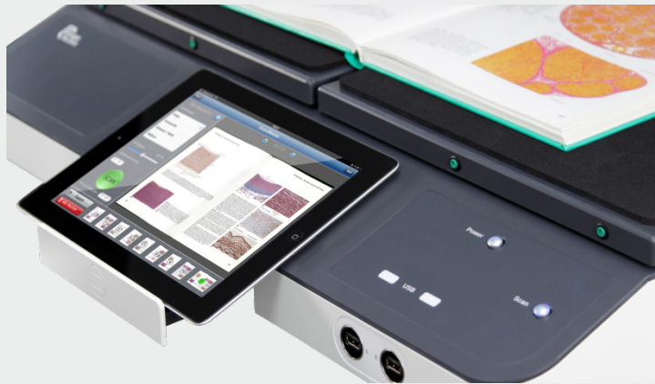
Pad tray simplifies operation

The Bookeye® 4 Kiosk copier has an integrated billing module. This means that for all applications that do not have an existing card or billing system, Bookeye® 4 Kiosk can take over the billing itself. Configurable invoice printing and journaling are standard functions in the Bookeye® 4 Kiosk as well as the remote locking / unlocking of the system.