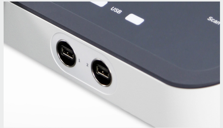
Two USB ports on the front let you take away your scanned images.